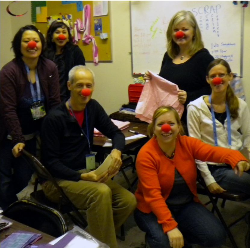
Our awesome volunteers logged 7,081 hours.